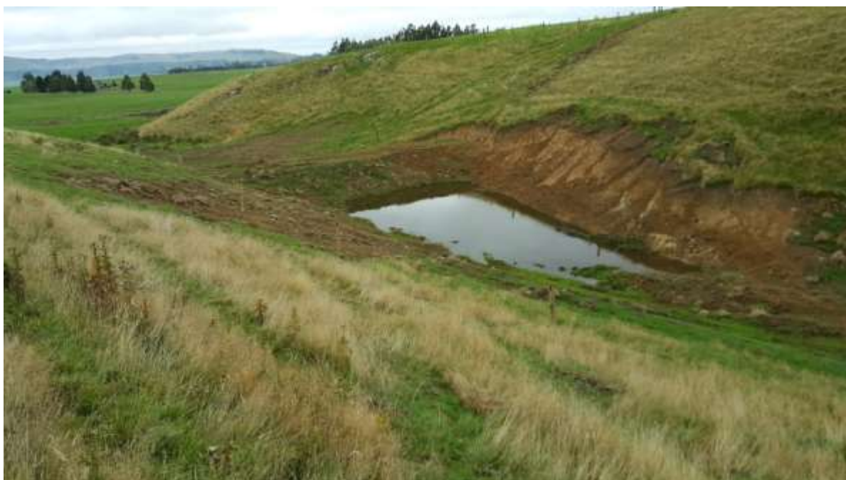
Figure 1: Typical example of a sediment trap with a bund, outlet to one side, keyed in to prevent leaks and located in a critical source area that will collect water from rainfall.